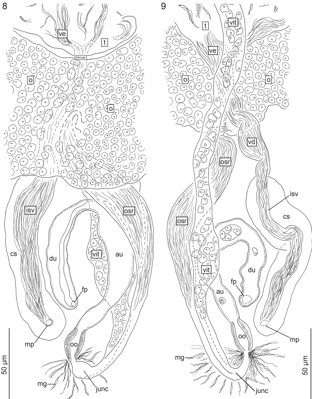
Figs. 8, 9. Genitalia of Nomasanguinicola canthoensis gen. et sp. n. from branchial vessels of bighead catfish, Clarias macrocephalus from the Mekong River, Vietnam. Fig. 8. Holotype (USNPC No. 106968). Dorsal view. Fig. 9. Paratype (USNPC No. 106969). Ventral view. Abbreviations: au – ascending segment of uterus; cs – cirrus-sac; du – descending segment of uterus; fp – female genital pore; isv – internal seminal vesicle; junc – junction of vitelline duct and oviduct; mp – male genital pore; mg – Mehlis’ gland; oo – ootype; o – ovary; osr – oviducal seminal receptacle; vit – primary vitelline duct; t – testis; ve – vasa efferentia; vd – vas deferens.